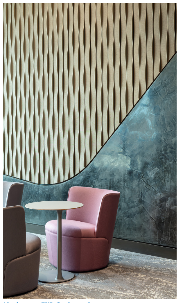
Northeastern EXP, Conference Room